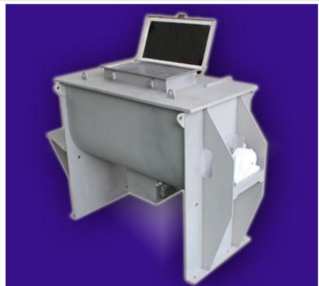
Internal View of PRB Ribbon Mixer